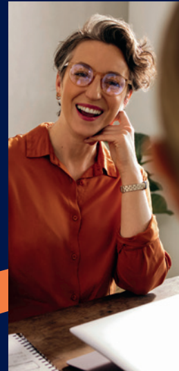
Legal & Consulting Services