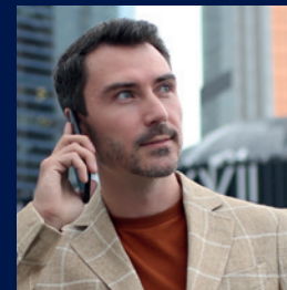
Financial Manager Service